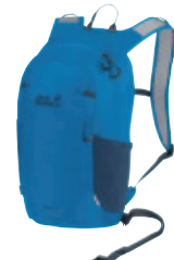
Velo Jam Serie