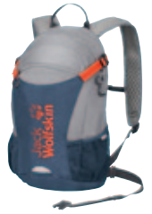
Velo City Serie