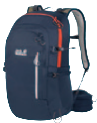
Atmos Shape Serie