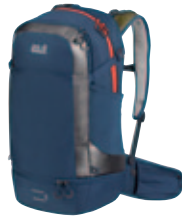
Moab Jam Serie